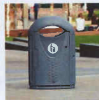
Glasdon Evolution - £319