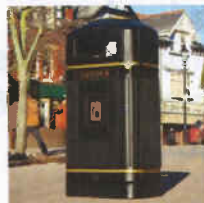
Glasdon Jubilee Streamline - £390