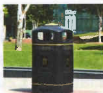
Glasdon Jubilee - £440