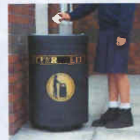
Glasdon Admiral - £184